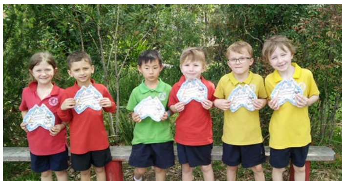
Congratulations to Our Award Winners

If you need uniforms for Term 1 next year please place your orders as soon as possible. The girl's dresses need to be made, so orders for these will need to be placed by Friday 1 December. If you have any questions or need to arrange a time to try on uniforms please email the uniform shop nlhiuniform@gmail.com . Order forms with exact money can be placed in the cream P&C box outside the office. Thank you.