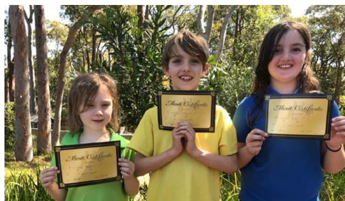
Congratulations to all our award winners from last week!